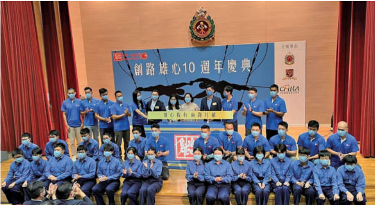
創路雄心計劃。 Path-finding Adventure Project.

「創路雄心」計劃創於2012年，以初中生為對象，由消防處與香港中文大學和社區精神健康促進會等機構合作，對在關鍵成長階段的學生予以匡導扶育，蒙以養正。