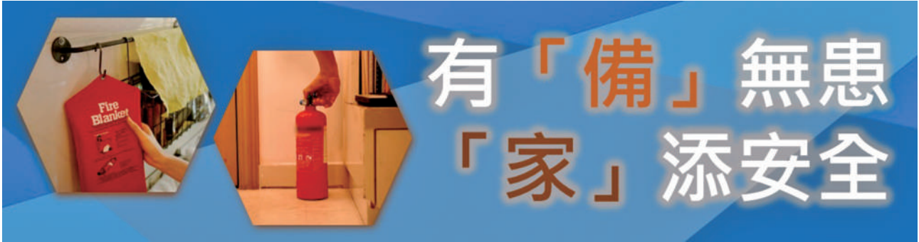
推廣家居手提滅火設備。 Promotion of portable firefighting equipment for use at domestic premises.