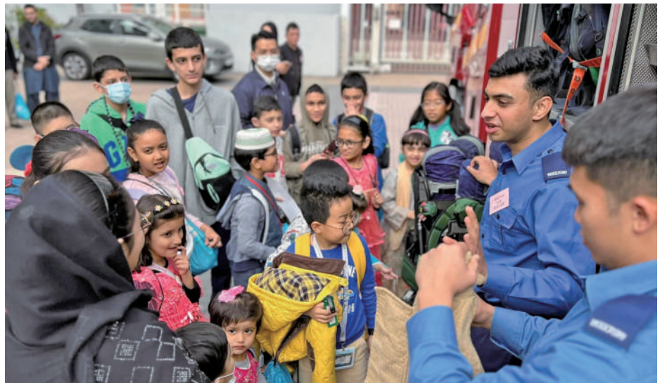
少數族裔青少年發展團隊活動。 Activities for the Ethnic Minority Youth Development Team.

The FSD, in collaboration with the Chinese University of Hong Kong and organisations including the Community Mental Health Association, initiated the PAP in 2012. The project targets junior secondary students who are in their critical development stage, and provides them with counselling, support and appropriate guidance.