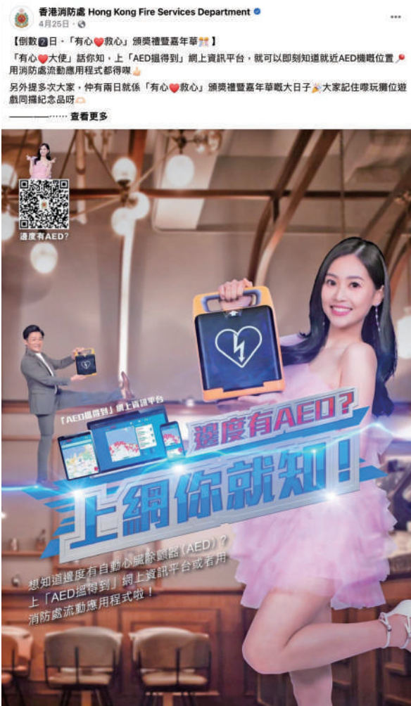
社交媒體宣傳：「有心救心」頒獎禮暨嘉年華。 Promotion through social media - Big Hearts, Save Hearts Awards Ceremony cum Carnival.