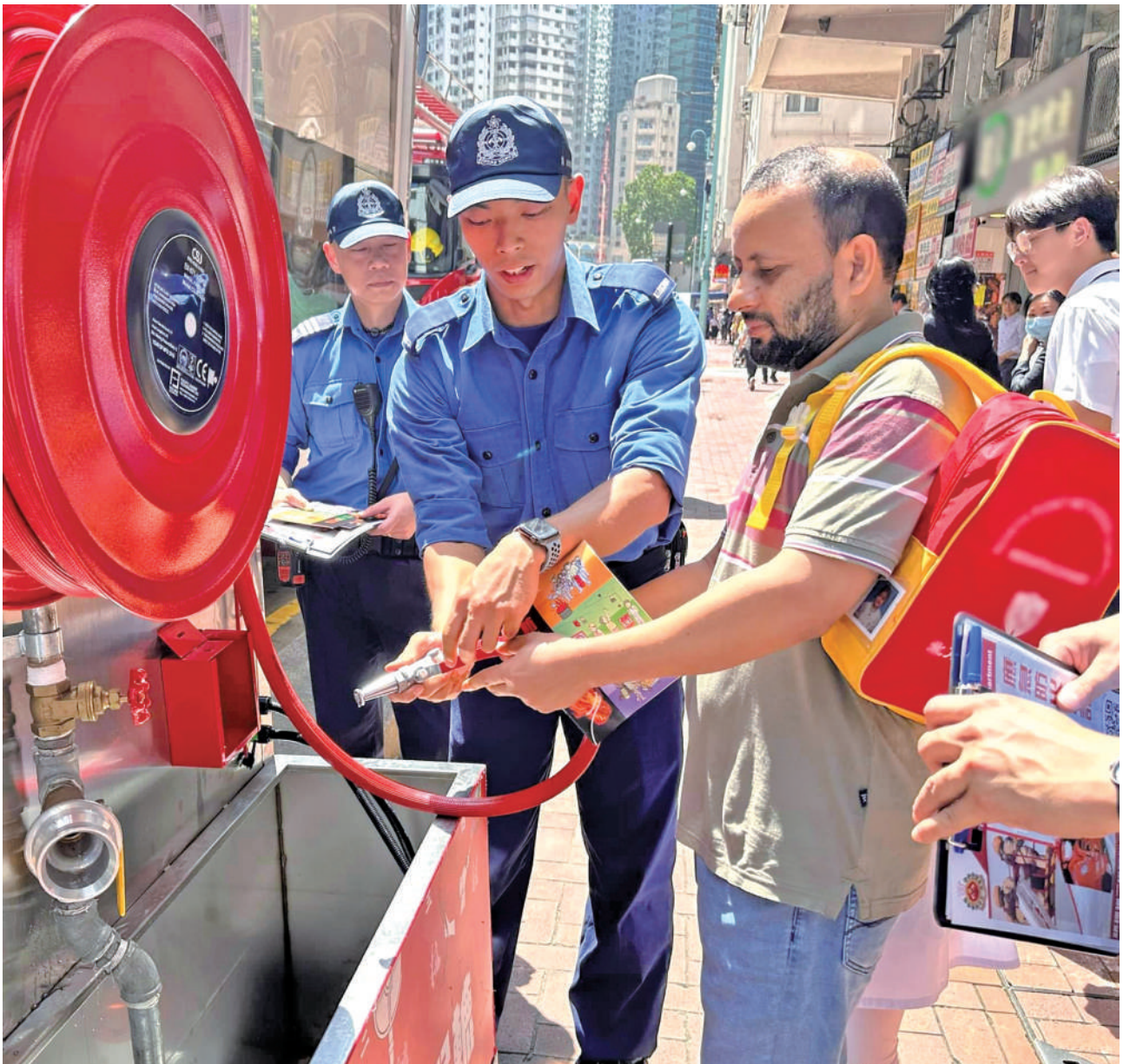
防火宣傳活動「打鐵趁熱」。 Hot Strike fire safety publicity campaign.

After a big fire or a fire that arouses public concern, the fire personnel from the relevant division will immediately produce a fire prevention publicity video and invite district organisations to jointly carry out publicity and education work on fire prevention in the district where the fire occurred while the fire is still fresh in their memory.