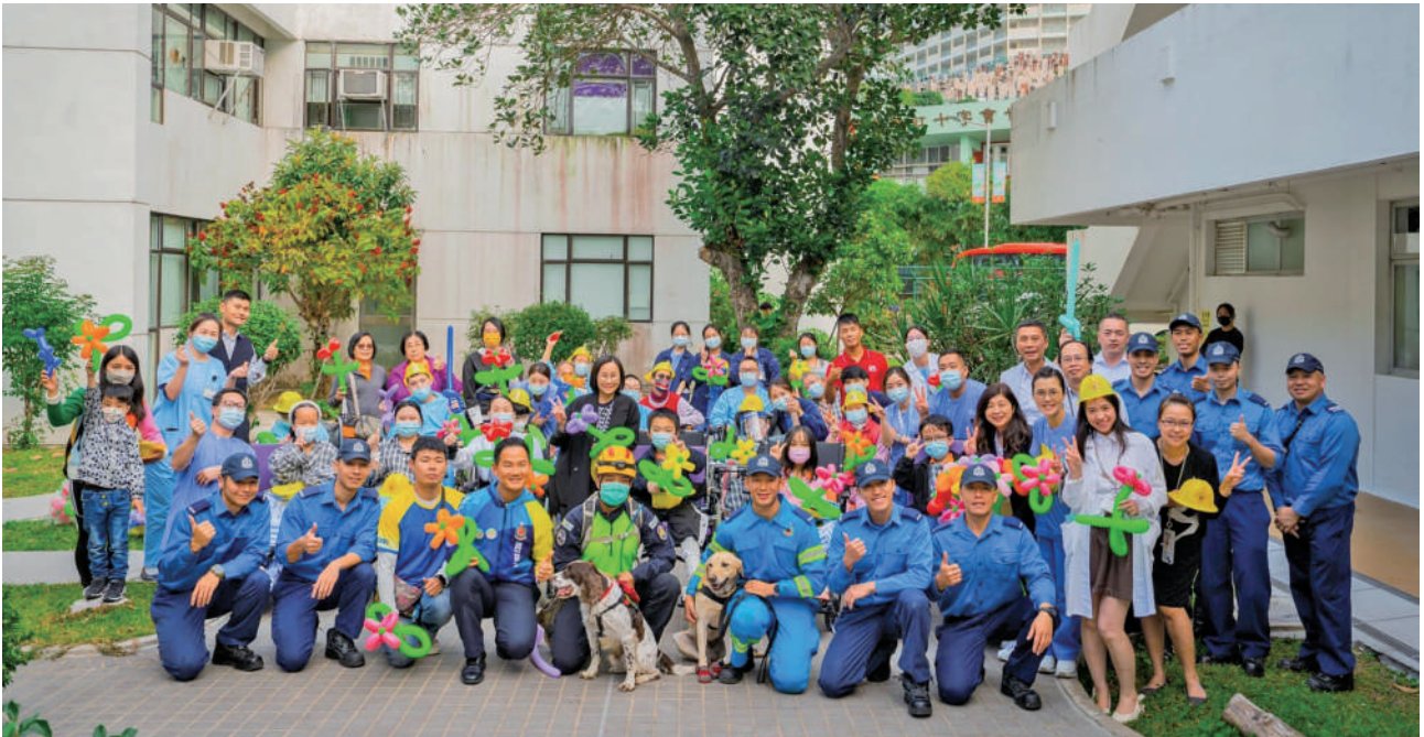
「消防安全大使計劃」活動。 Activity of The Fire Safety Ambassador Scheme.