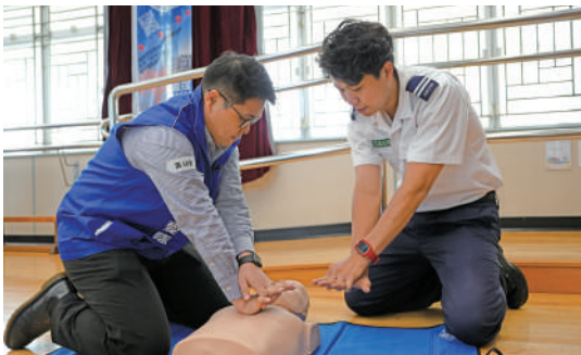
救護人員教授地區關愛隊隊員有關心肺復甦法。 Ambulance personnel teaches a district Care Team member about CPR.