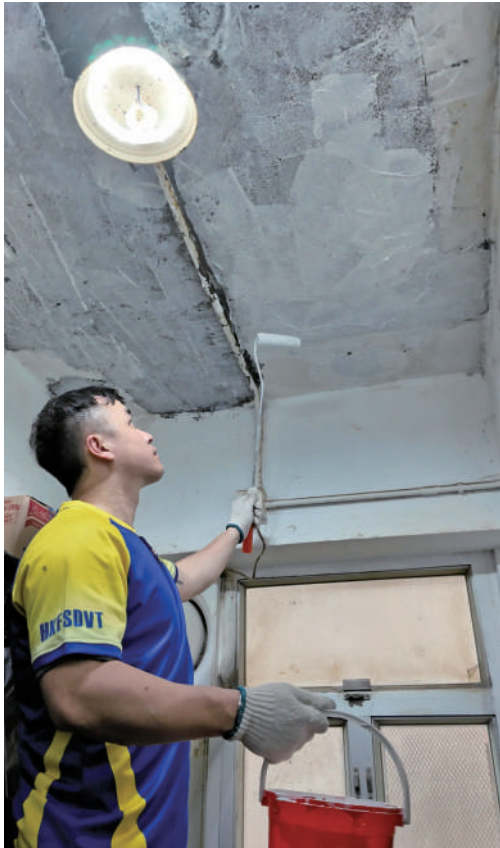
義工隊提供社會服務。 The Volunteer Team provides community services.

義工隊於2002年成立，由超過1,800名軍裝和文職人員組成。義工隊積極參與志願活動，又向市民派發「防火三寶」，並協助有需要人士安裝獨立火警偵測器，提升家居消防安全。除此之外，義工隊提供災後服務及火後服務，協助經濟有困難的家庭在火警或意外事故後重建家園。