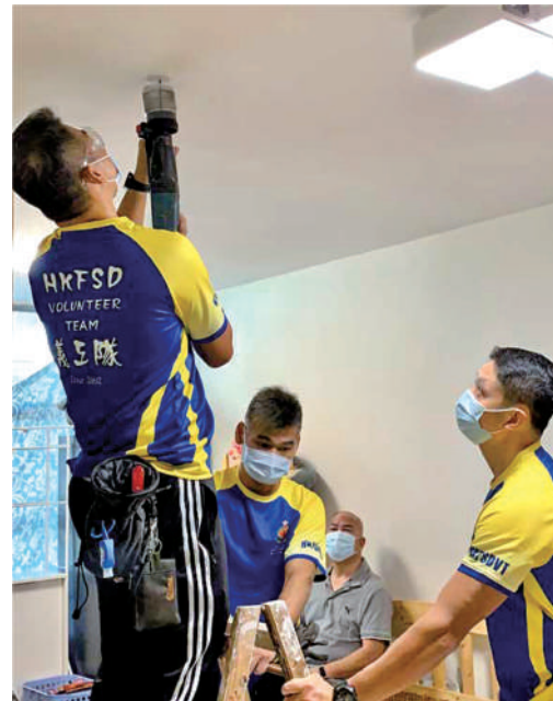
義工隊協助市民安裝獨立火警偵測器。 The Volunteer Team helps members of the public install stand-alone fire detectors.

Established in 2002, the FSD Volunteer Team has over 1,800 members comprising uniformed and civilian staff. Apart from actively participating in volunteer activities, the team also assists in enhancing home fire safety by distributing the "Three Treasures for Fire Protection" to members of the public and helping those in need to install stand-alone fire detectors. The team also helps in the relief efforts after major natural disasters and provides post-fire services, such as helping families with financial difficulties to rebuild their homes after fires or other incidents.