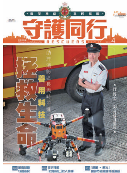
消防處刊物《守護同行》。 FSD's publication rescuers.

消防處於2018年推出宣傳角色「任何仁」，向公眾推廣「只要敢，就救到人」的信息。其諧音「任何人」，亦寓意「任何人都可以救人」。