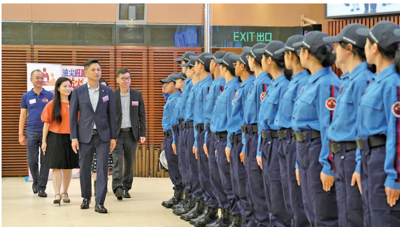
消防及救護青年團就職典禮。 FAST Connect Inauguration Ceremony.