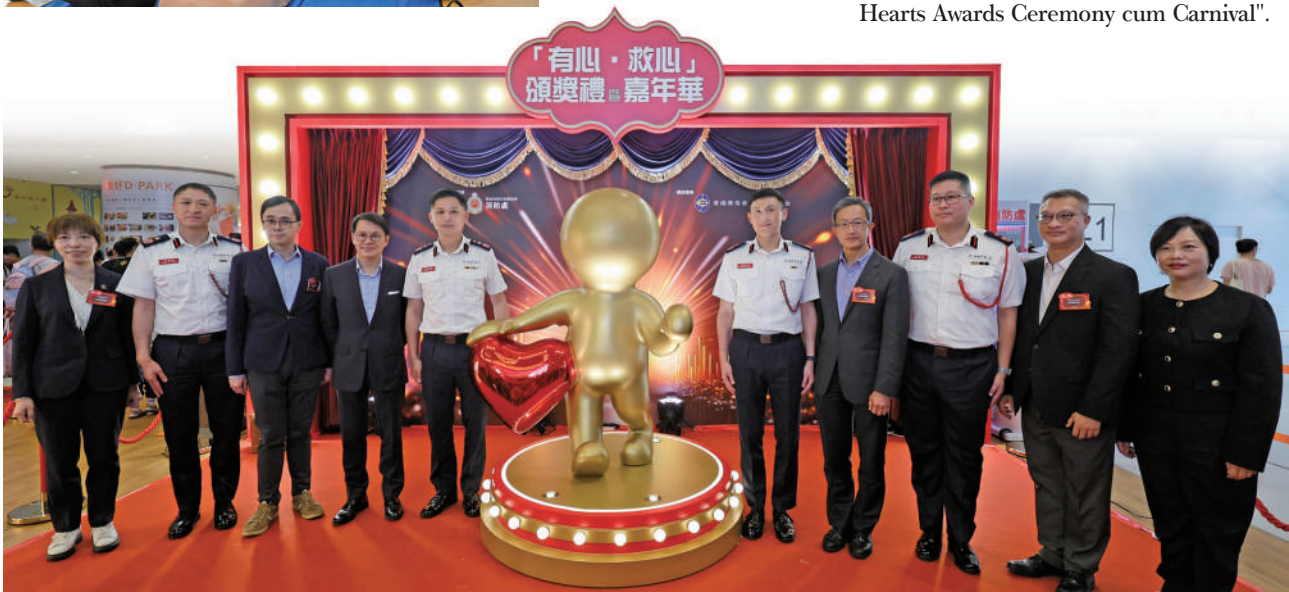
「有心·救心」頒獎禮暨嘉年華啟動禮。 Launching ceremony of "Big Hearts, Save Hearts Awards Ceremony cum Carnival".