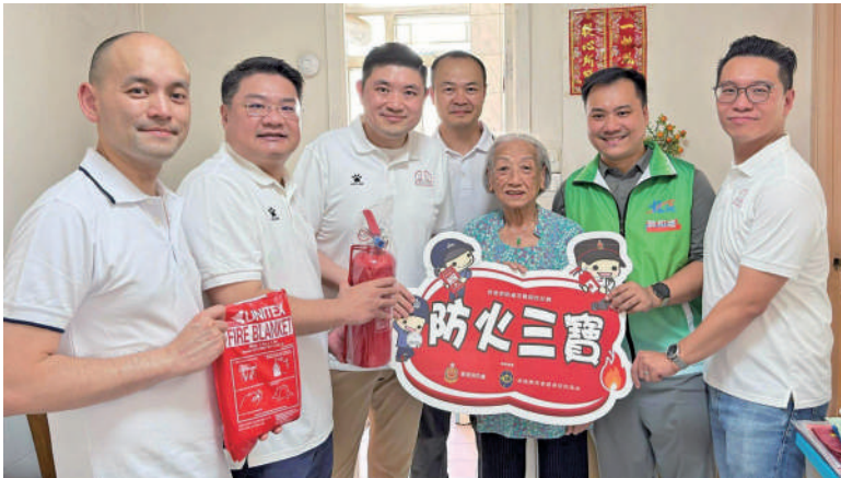
小心煮食爐火，慎防家居火警。 Use cooking stoves with care, beware of domestic fire.