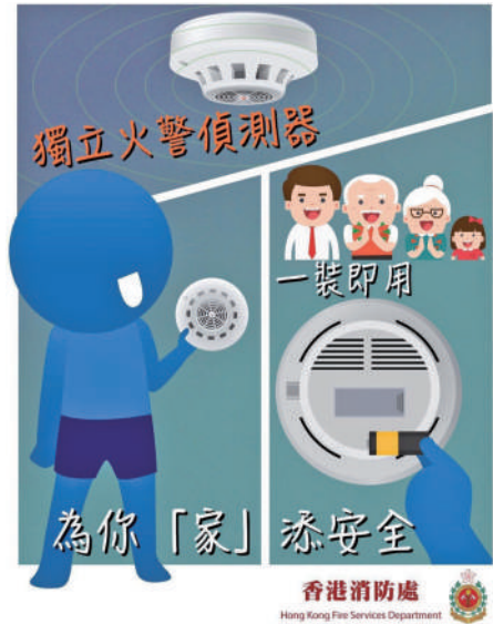
鼓勵在家安裝獨立火警偵測器。 Encouraging the installation of stand-alone fire detectors at home.