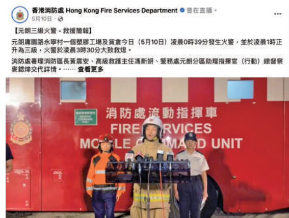
社交媒體發放：事故現場救援簡報。 Dissemination through social media: Incident press stand-up.